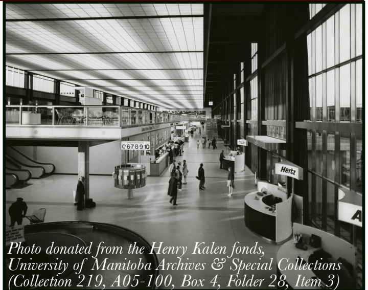
(Collection 219, A05-100, Box 4, Folder 28, Item 3)